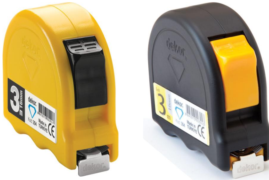
Figure 2 Examples of the case style