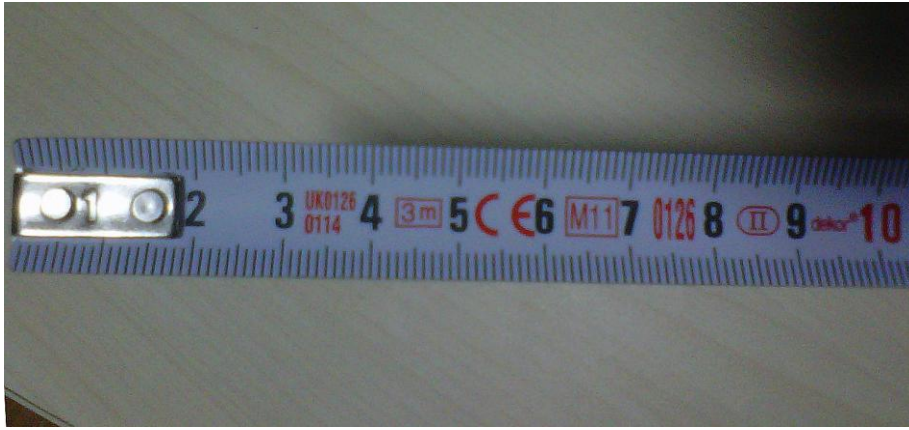
Figure 1 Example of the tape blade and markings