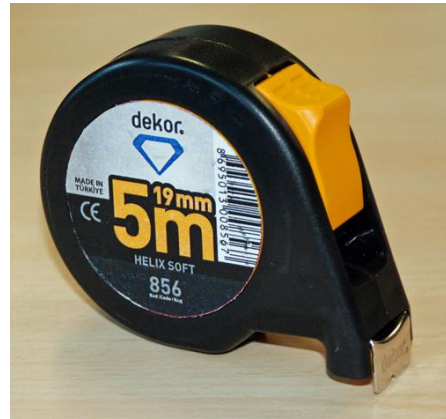
Figure 4 Examples of alternative case styles