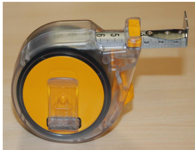
Figure 5 Example of alternative case style