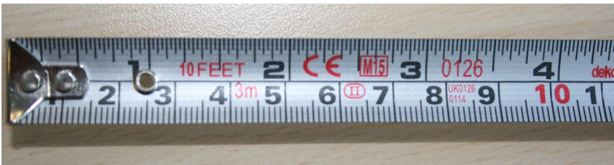
Figure 3 Example of the dual marked tape blade